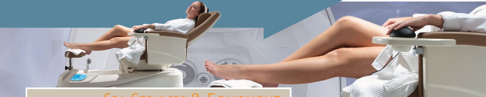
SPA SERVICES & EQUIPMENT